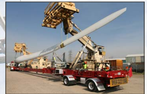
High capacity cargo handling equipment to 95,000# including top-pick capability