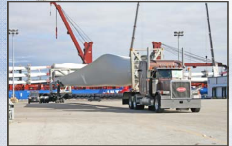
40' wind turbine blades safely transferred on stretched-trailers to storage