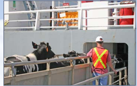
Safe and efficient loading of specialized livestock vessels