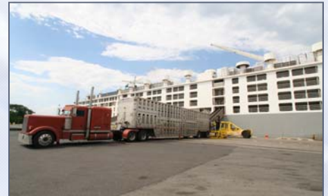
Stress-free transport to and onto vessel via 2-truck loading platforms; multiple side-port capability