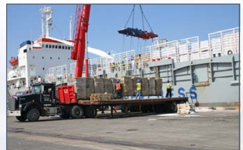
Breakbulk loading of unitized hay and bedding + breakbulk/bulk loading of feed